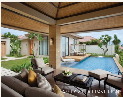
FAMILY VILLA I PAVILLION