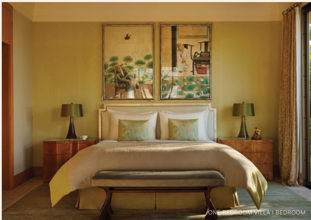
ONE BEDROOM VILLA | BEDROOM