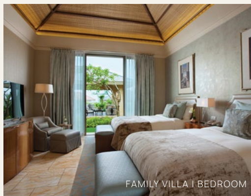
FAMILY VILLA I BEDROOM