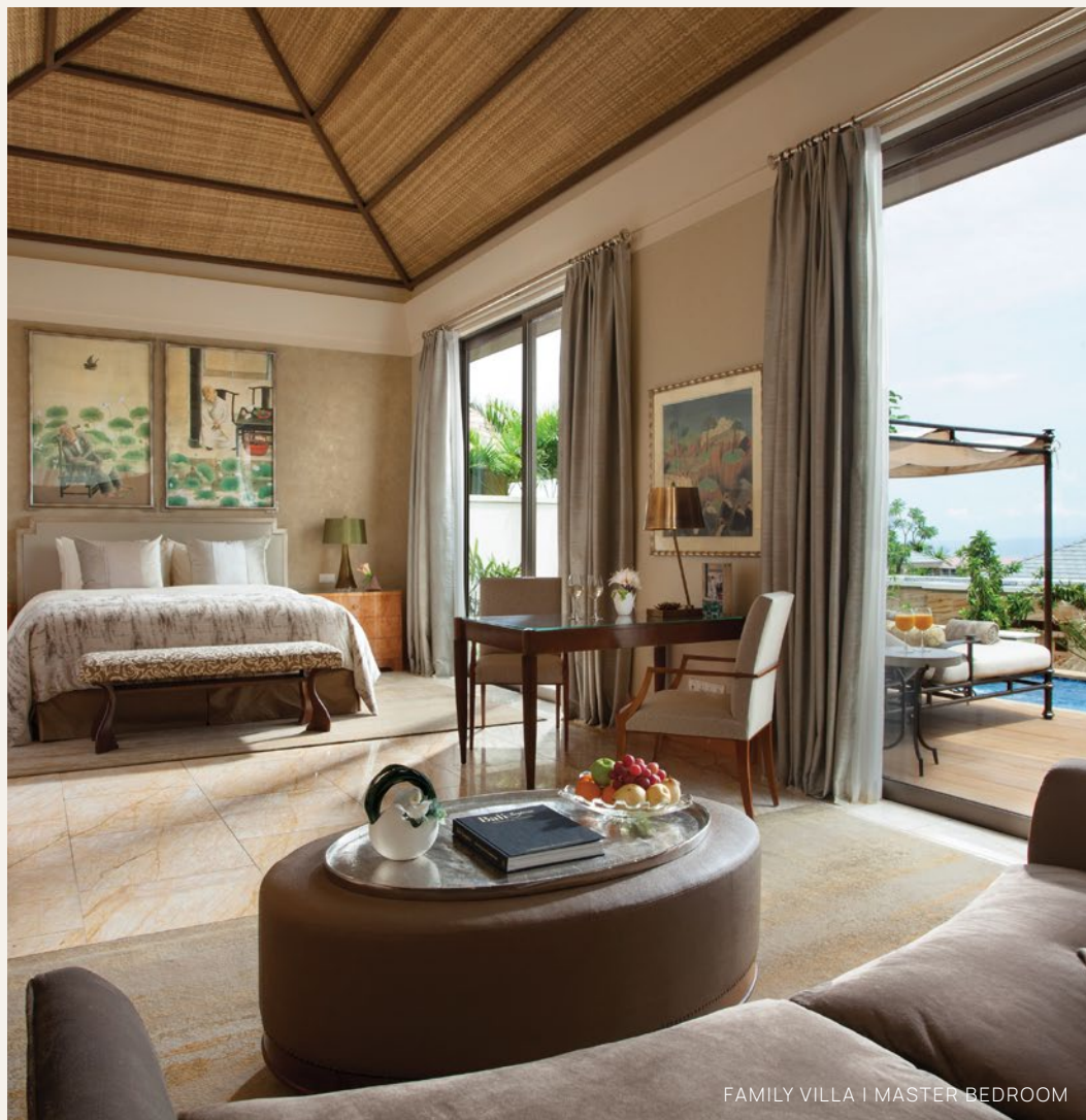
FAMILY VILLA I MASTER BEDROOM