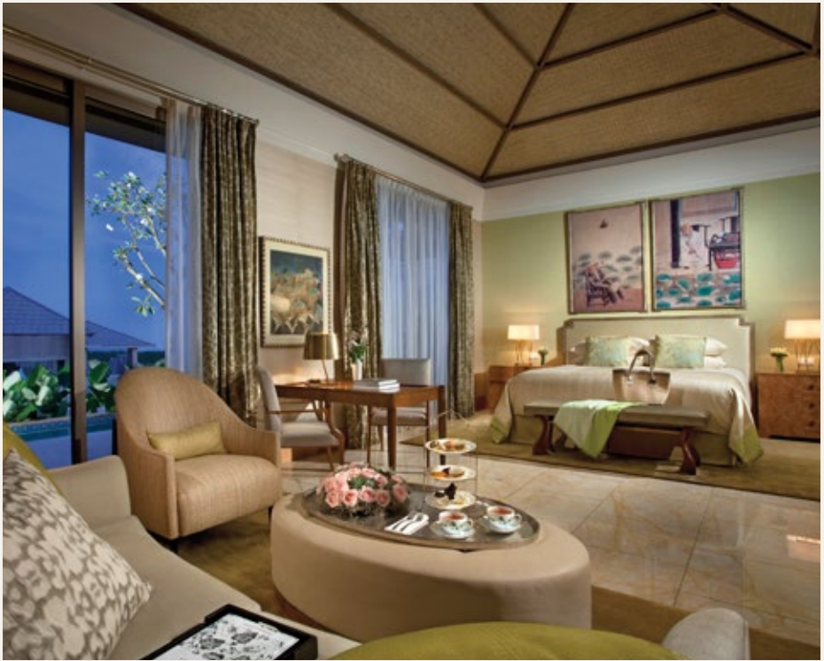
ONE BEDROOM VILLA | BEDROOM