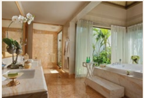
ONE BEDROOM VILLA | BATHROOM