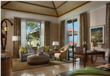
ONE BEDROOM VILLA | LIVING ROOM