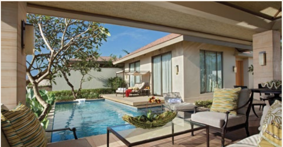
ONE BEDROOM VILLA | PAVILLION