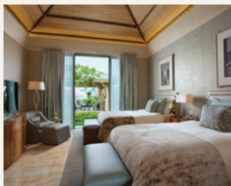
FAMILY VILLA | BEDROOM