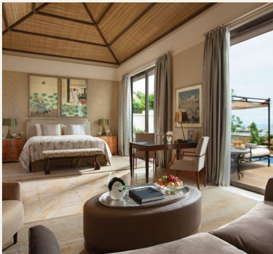
FAMILY VILLA | MASTER BEDROOM