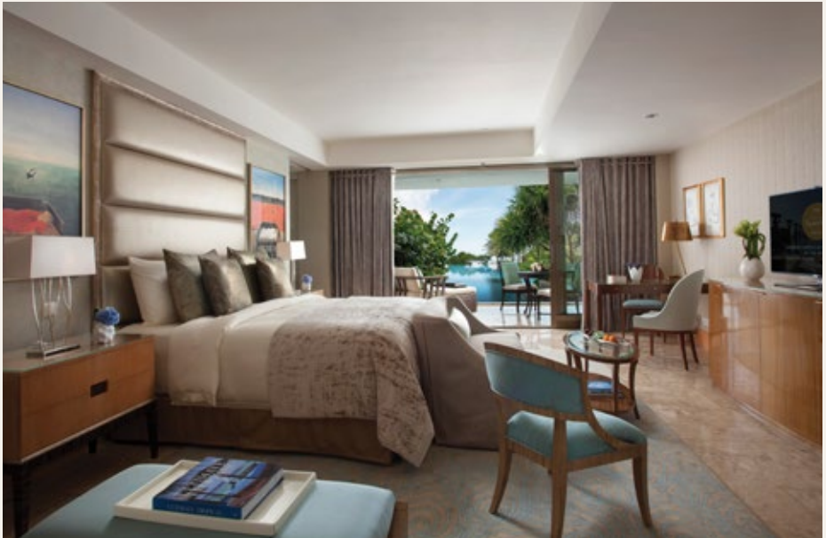
THE BARON LAGOON ACCESS