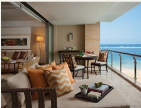
THE EARL BEACHFRONT | PATIO