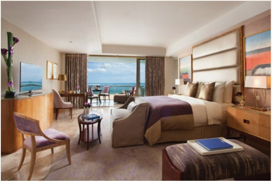
THE BARON BEACHFRONT VIEW