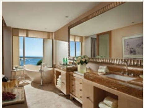
THE EARL BEACHFRONT | BATHROOM