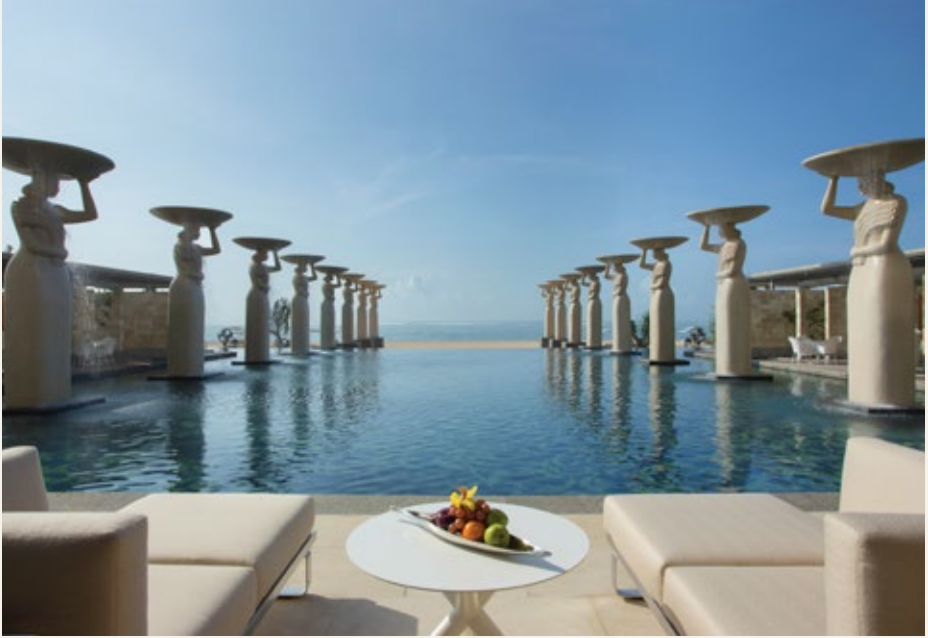
THE OASIS POOL