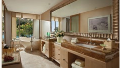
THE EARL GARDEN | BATHROOM