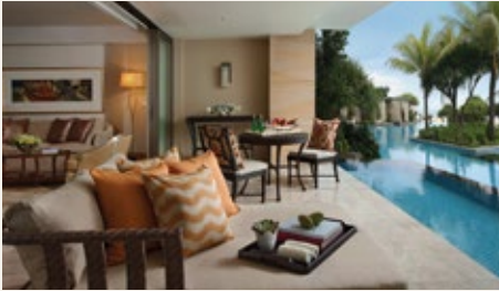
THE EARL LAGOON ACCESS | PATIO