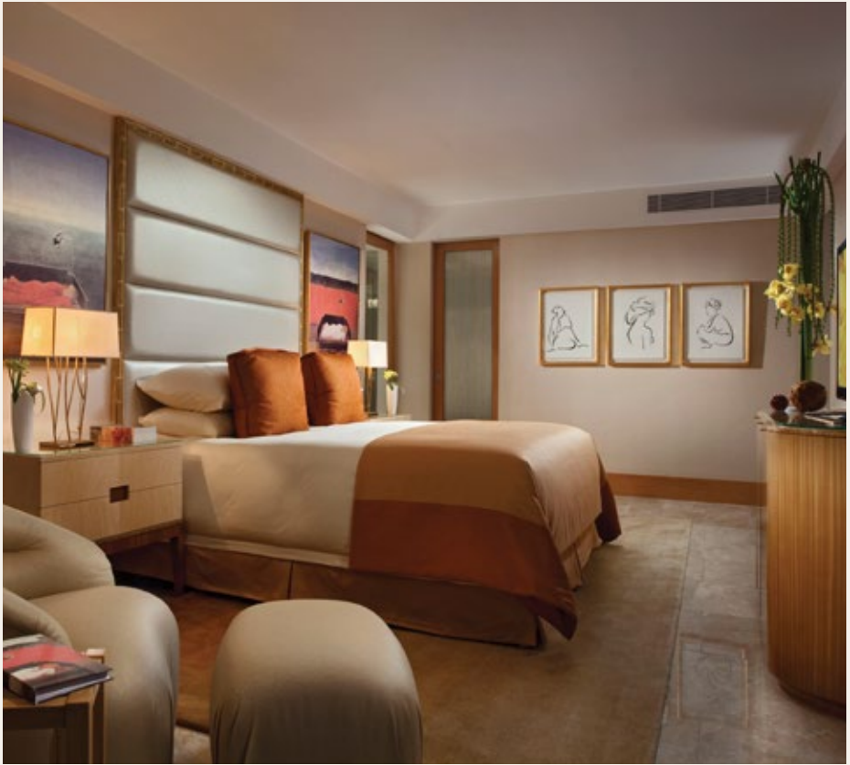
THE EARL SUITE | BEDROOM